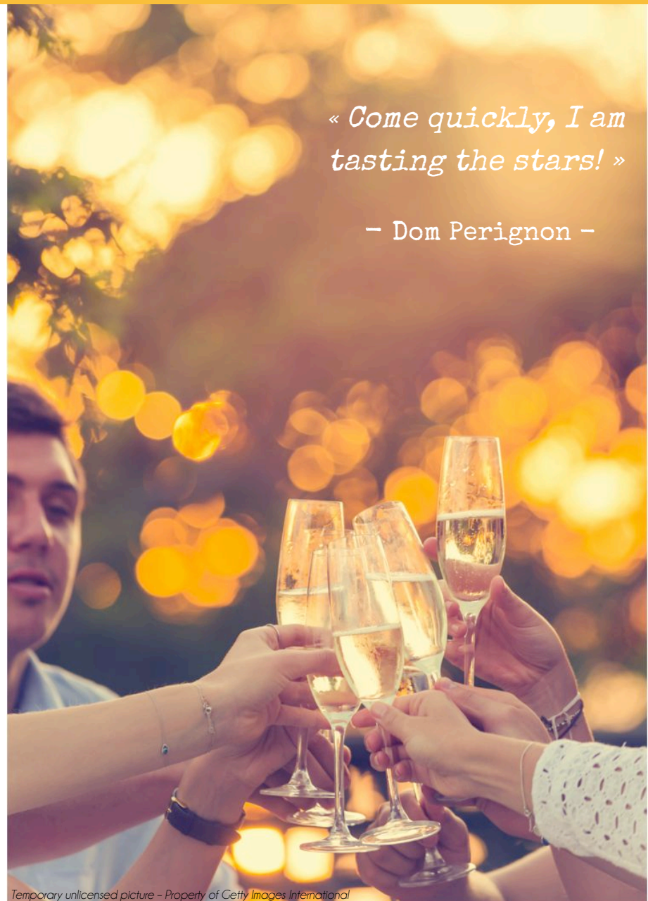
Temporary unlicensed picture - Property of Cetty Images International